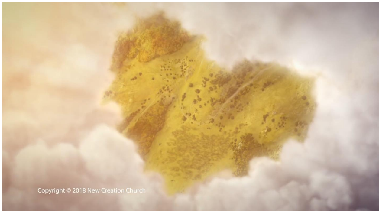
Copyright © 2018 New Creation Church

这里有一句可爱的经文要我们学习和记住，你可能也想要标记强调一下。在箴言 10:28，告诉我们“义人的盼望必得喜乐……”这节经文说，“义人的盼望是会得喜乐的。”不是也许会，而是一定会得到喜乐！你不必担心和疑惑，你可以确信祂有能力并且愿意帮助你。当祂这样为你做时，你会很开心。所以，下次你担心或疑惑某事的时候，记住你今天听到的。请记住…请记住耶稣在十字架上大声且清晰地回答我们：“是的，我愿意！看我有多爱你们！”当你记住十字架的救恩，你就可以确信，每一次你仰望主的时候，答案总是会令你欢欣鼓舞的。“义人的盼望——你和我——必得喜乐！所有孩子们一起说‘阿门’”！